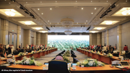
Xi Jinping, the capital of South Korea