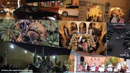
Alanya, the capital of Turkey tourism